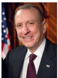
Sen. Arlen Specter (D-PA), May 5, 2010

customers. So I think while there are many activists who have for years been pushing for additional funding for the National Institutes of Health, I think in some ways I've been disappointed by the lack of aggressive activism on the part of so many professionals in the field. "