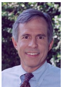
House Science and Technology Committee Chairman Bart Gordon (D-TN), May 13, 2010 (left)

"The scientific community is going to have to become a lot more politically active in blowing your own horn. The statistics are very impressive as to what the increased funding did for NIH on mortality rates, on strokes, and much progress on many strains of cancer, heart disease and right down the line. I think what you have to do for the congress and for the administration is show how many dollars it saves. ... Appropriations run on politics, on the pressure. You've got a great case, but it hasn't been expressed very well."