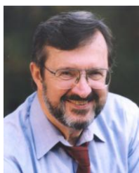
House Appropriations Committee Chairman David Obey (D-WI), April 28, 2010

"I've always been rather disappointed that in my many conversations with people in the medical field, with providers in the field, that the discussion, when it turns to health care, so often is focused simply on issues such as reimbursement rates—what are hospitals going to get by way of compensation, what are doctors going to get paid—and that's all very legitimate. But I have personally been struck by the lack of comment or curiosity or, for that matter, the lack of visible political support for added medical research—which, after all, lays the foundation for the product that the practitioners in the health care area have to offer their patients and their