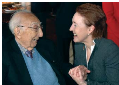
Baylor College of Medicine

It's impossible to convey just how much Research!America Honorary Board Director Michael E. DeBakey, MD , did for medical research. He died July 11 as a