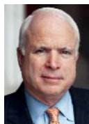
Sen. John McCain

Republican presidential candidate Sen. John McCain recently shared his stances on health, science and research in Your Candidates—Your Health . He joins Democratic candidate Sen.