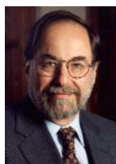
David Baltimore, PhD

David Baltimore, PhD, will be the recipient of Research!America's Builders of Science Award at the 2009 Advocacy Awards Gala on March 24 at the Andrew W. Mellon Auditorium.