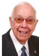
The Hon. Paul G. Rogers

group of 25 Ambassadors. In strategic consultation with Research!America, these leading researchers will meet with