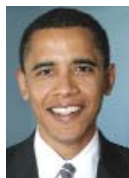
Sen. Barack Obama

Barack Obama , who responded earlier. Nearly 200 congressional candidates have also declared their positions through the online voter education initiative, and others are being invited as their state primaries take place. To view responses, visit www.yourcandidatesyourhealth.org .