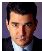
Scott Gottleib, MD

past chair of the U.S. Chamber Board of Directors, provided opening remarks. Scott Gottleib, MD , was the featured speaker, and The Hon. Billy Tauzin , president and CEO of the Pharmaceutical Research and Manufacturers of America and Research!America