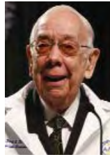
The Hon. Paul G. Rogers

The Honorable Paul G. Rogers , Research!America chair emeritus, received the 2008 President's Award from American Academy of Physician Assistants , a Research!America member, for his outstanding public service and historic role in support of health care.