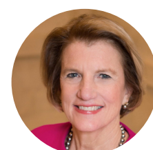
The Honorable Shelley Moore Capito