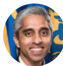
Vice Admiral Vivek H. Murthy, MD, MBA U.S. Surgeon General, Department of Health and Human Services