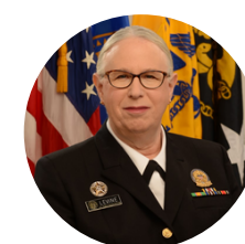
Admiral Rachel L. Levine, MD

Assistant Secretary for Health, Department of Health and Human Services